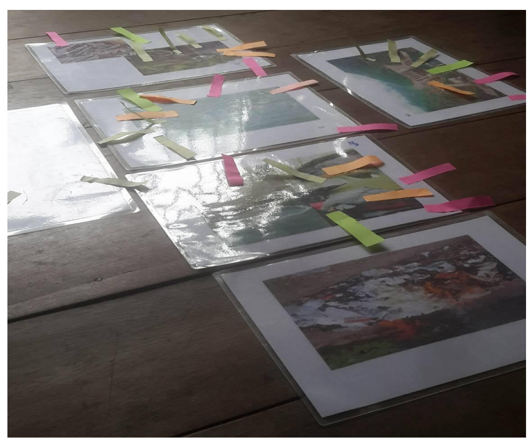
Conservation in Ramsar site Cambodia"

"Changing perceptions for Active Biodiversity