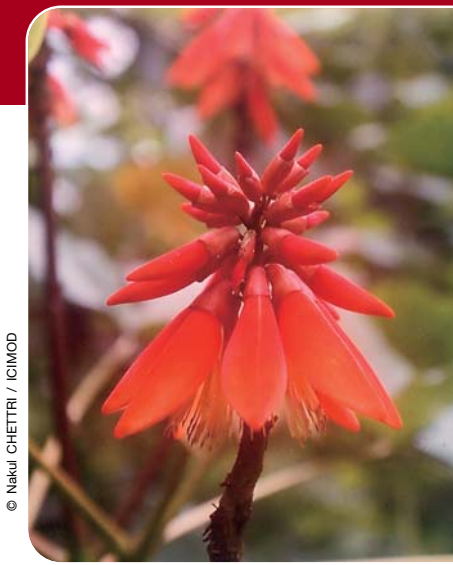
Erythrina spp., Sikkim, India

new funding for achieving conservation outcomes