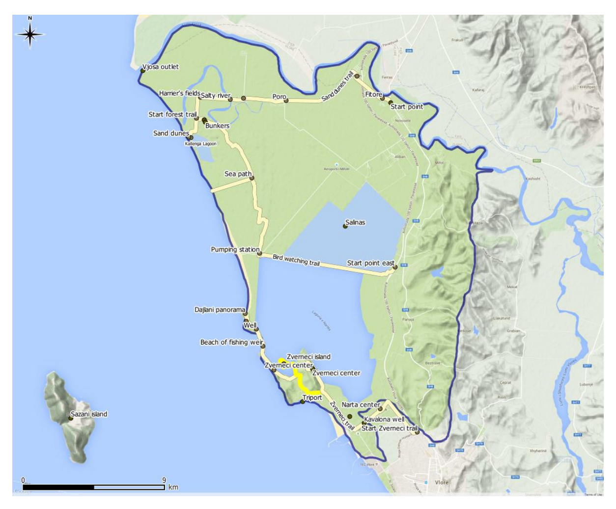
Map 5. Segment_2_Trail_2_Narte