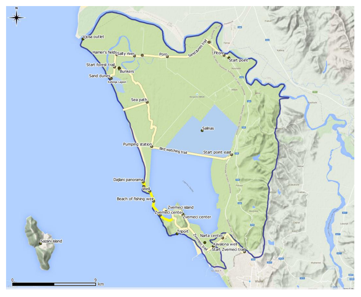
Map 6. Segment_3_trail_2_Narte