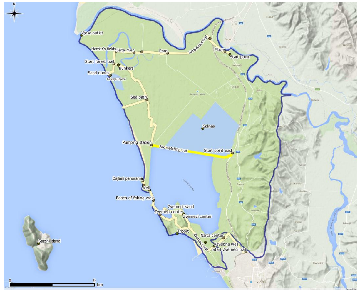
Map 3. Segment_3_trail_1_Narte