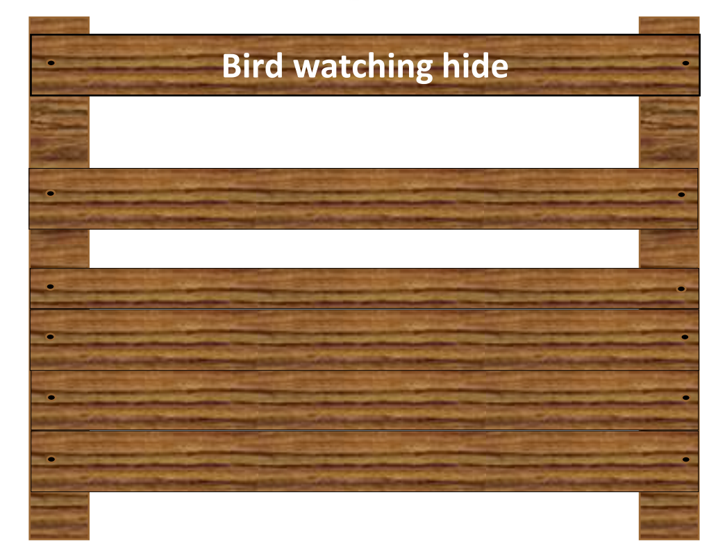
Fig 3. Bird watching hide