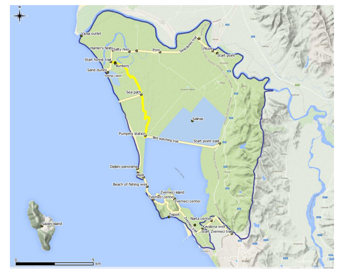
Map 2. Segment_2_trail_1_Narte