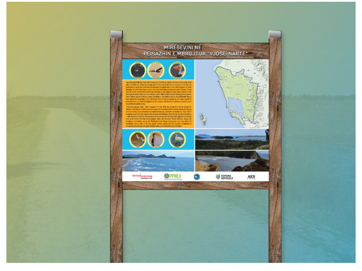
Fig1. Illustration of the big tables