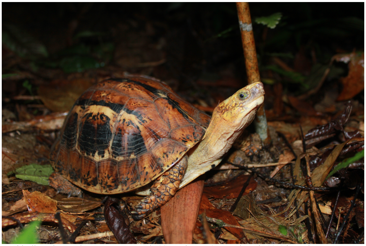
A critically endangered Bourret's Box Turtle ( Cuora bourreti ) was release in 2019 in Saola Hue Nature Reserve.

The IMC/ATP has conducted a number of interview surveys around Bach Ma National Park since 2011, these were combined with broader provincial wide interview surveys that had focus on Nam Dong, A Luoi and Phu Loc districts in the buffer zones of Bach Ma National Park and Sao La Nature Rerserve. In 2019 a group of confiscated and rehabilitated Bourret's box Turtles were released into Bach Ma national Park and Sao La nature reserve. Six of the animals released into Bach Ma were attached with radio transmitters and have been monitored on a monthly basis to determine survival. Bach Ma National Park has also been designated the site for the construction of a conservation breeding centre for a group of highly threatened Annamite priority species, including the Bourret box Turtle. The Bach Ma Conservation Breeding Centre is part of a joint project by the Bach Ma National Park, WWF, GWC, Worclaw Zoo and the IMC/ATP. The Joint project will also support biodiversity monitoring to create a baseline for documenting the recovery of critical species, including Bourret's box Turtle, through protection and animal reintroductions to augment remnant populations.