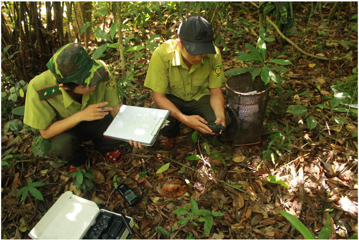
Bach Ma rangers collecting environmental data at the release location of one of six radio-tracking Bourret's box turtles.