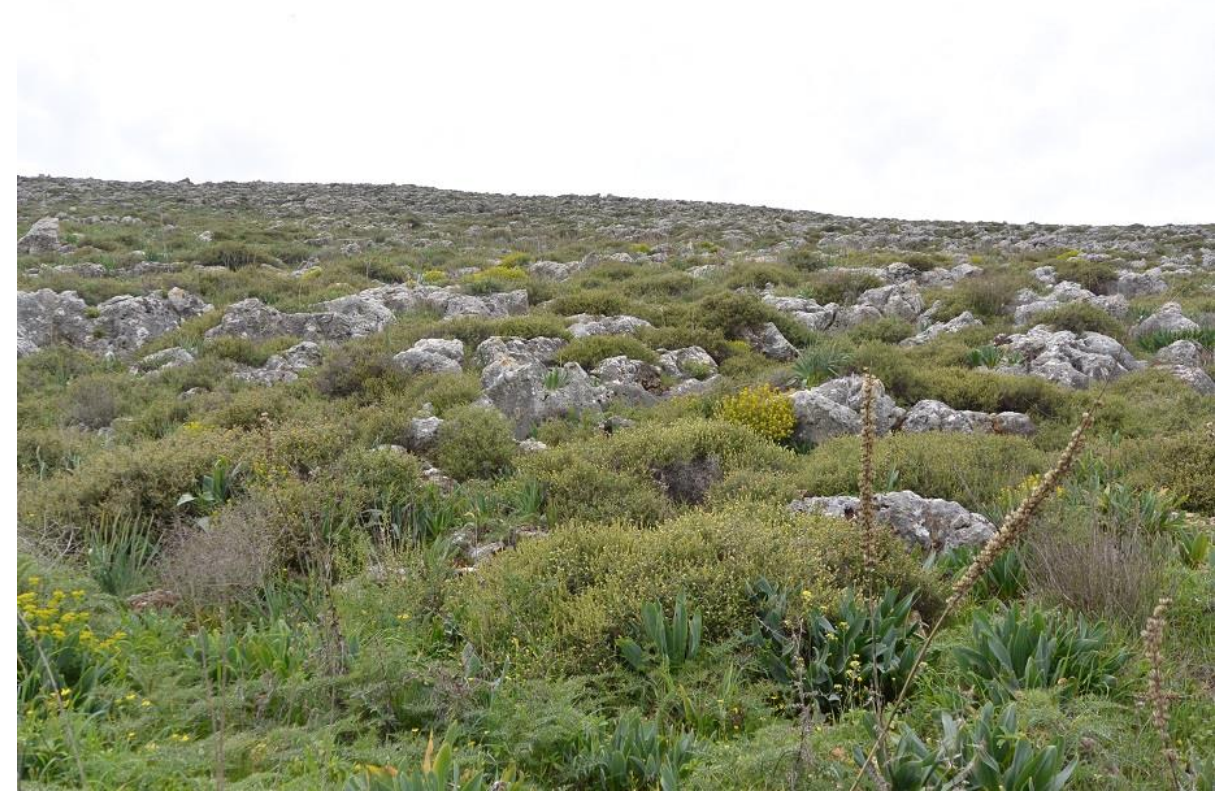
The slope on which Iris bismarckiana grows, March 2014