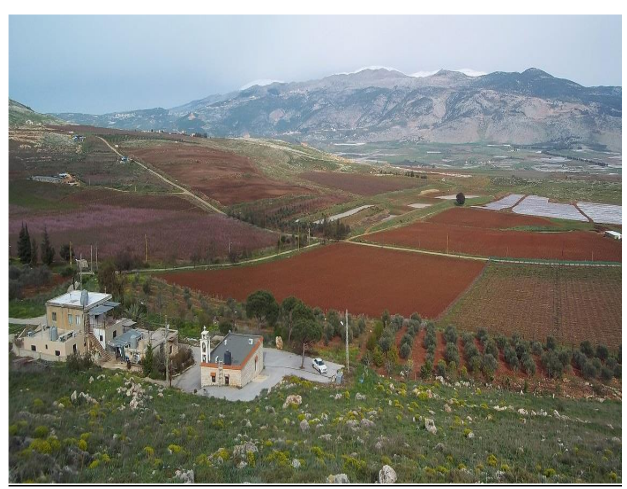
View from the slope of Sarada, March 2014 (Hicham Elzein)