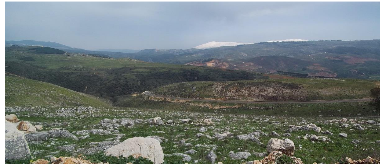
Typical landscape in the region of Marjayoun, with snow covered Mount Hermon, March 2014 (Hicham Elzein)