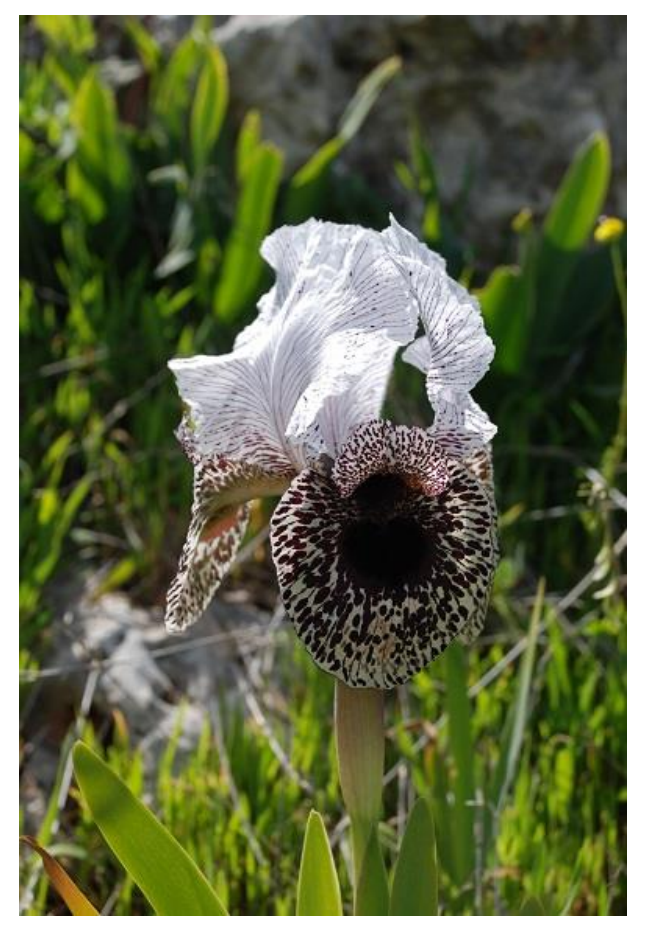
Iris bismarckiana at Sarada in March 2012