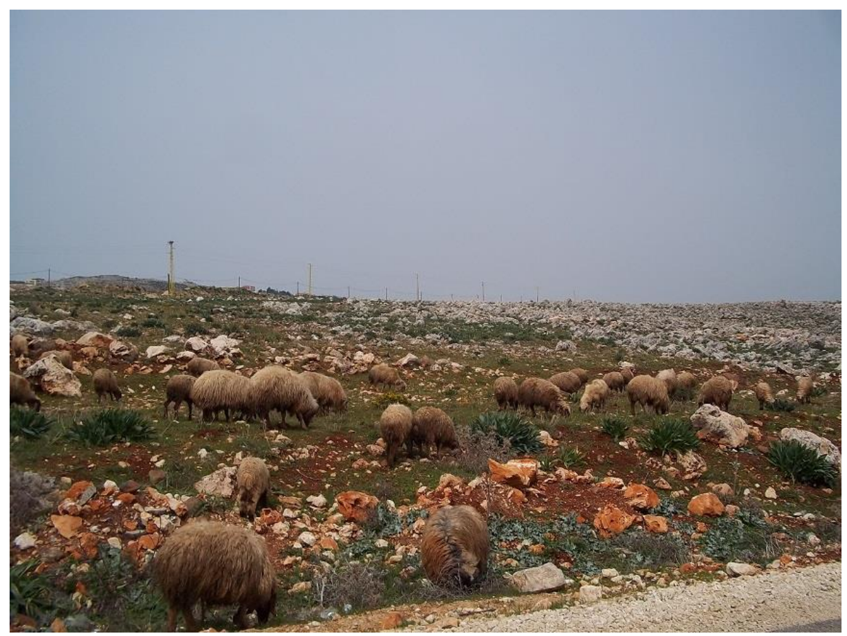
A flock of sheep grazing on very disturbed rocky lands nearby Sarada, March 2014 (Hicham Elzein)