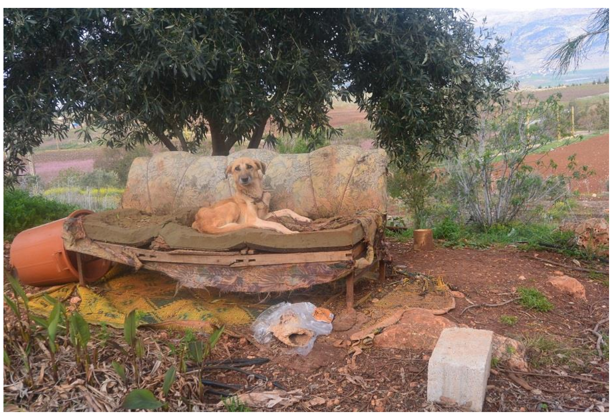
A dog of Sarada keeping an eye on the site, March 2014

In case a conflict arouse as a consequence of the project, and could not be resolved locally, stakeholders would be informed that they can fill an official complaint, first to the Executive director of CEPF, or, should the problem not be solved, to the World Bank. All procedures included internet website to use to fill complaints, would be provided to stakeholders by the project team.