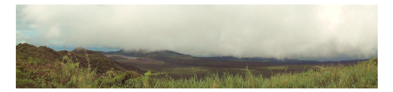
Figure 3. View from Des Voeux Peak over a large part of the lower-lying forested interior of Taveuni island.

larger chance of success. In the following chapter, I will outline a suggestion for further research on M. acrodonta .