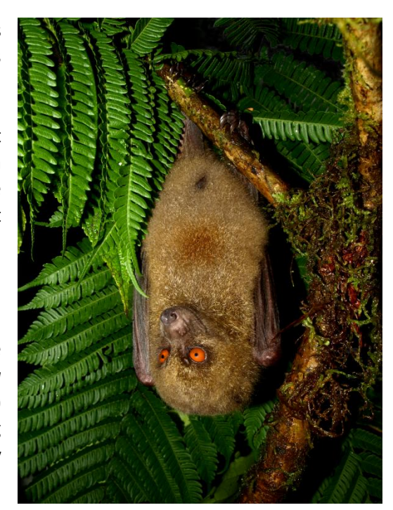
Figure 1. Mirimiri acrodonta .

As part of a project on the 'Conservation of the Critically Endangered Fiji flying fox Mirimiri acrodonta on Taveuni Island, Fiji', NatureFiji-MareqetiViti (NFMV) has prepared a Species Recovery Plan for the Fiji flying fox (Watling, 2010). The first objective of this Recovery Plan is to determine the Fiji flying fox's distribution and landscape use on Taveuni. The Fiji flying fox has only been observed in the high altitude forests on Taveuni, and it has been presumed to occur only in forest above