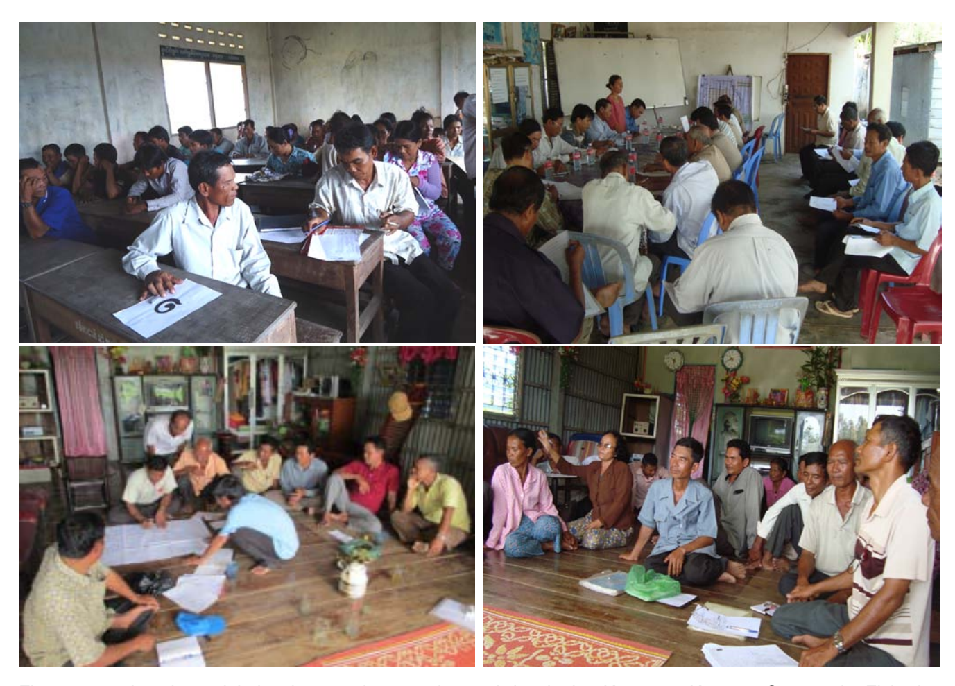
Figure 1 - 4: Local people's involvement in preparing and developing Kampong Krasang Community Fisheries Committee.