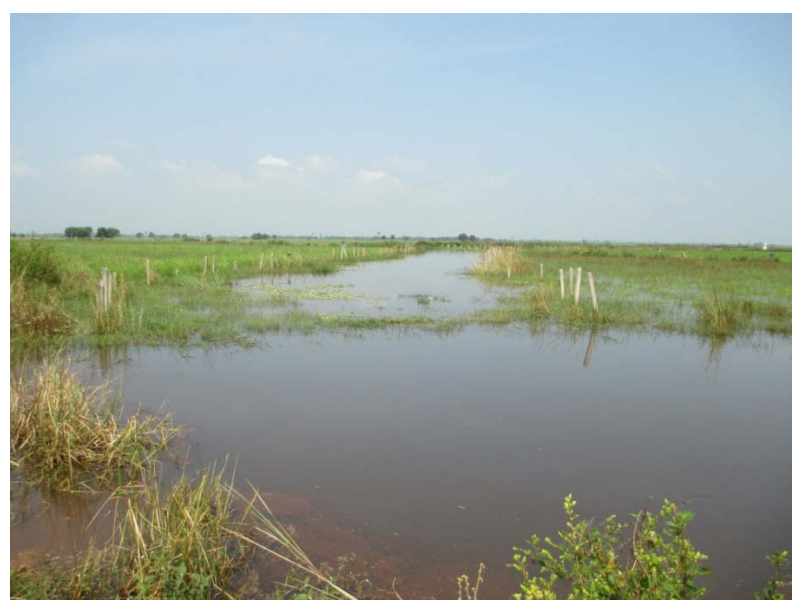
Figure 5 - 7: A study tour conducted to Champei Put Sor Community Fisheries in Bati district, Takeo province by CCK