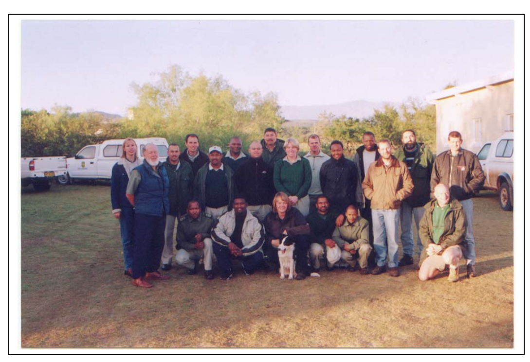
Group photo of facilitators and participants – Basic Course at Vrolijkheid Nature Reserve June 2003